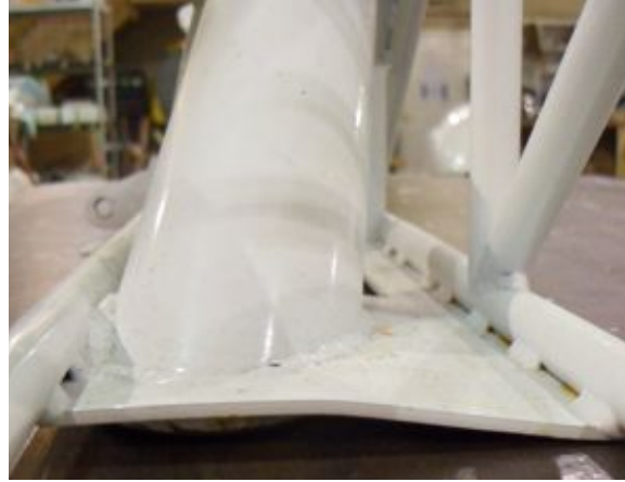
Figure 2: deformation of lower socket plate V1