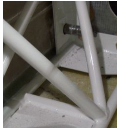
Figure 4: Gusset added to lower plate V2