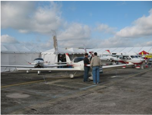
The Lightning booth