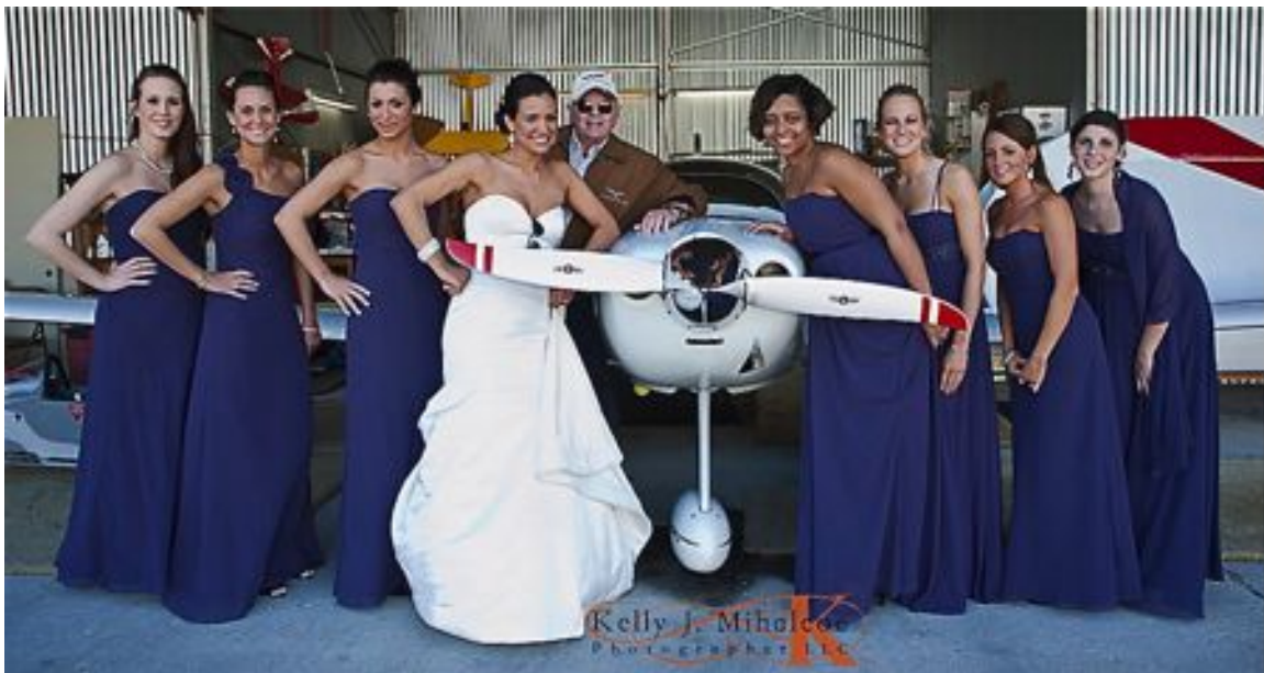
Can you find Buz?

The photo below will give you an idea of the unusual day at the airport.