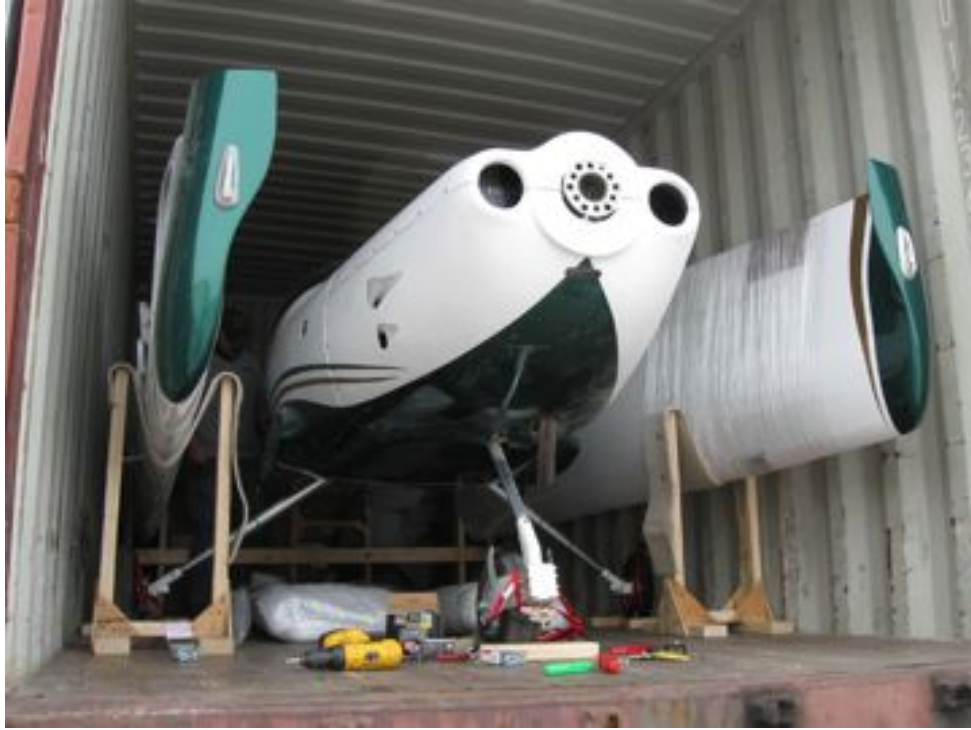
Almost ready to go.