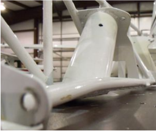
Figure 1: deformation of rear ½” tube box V1 socket plate V1